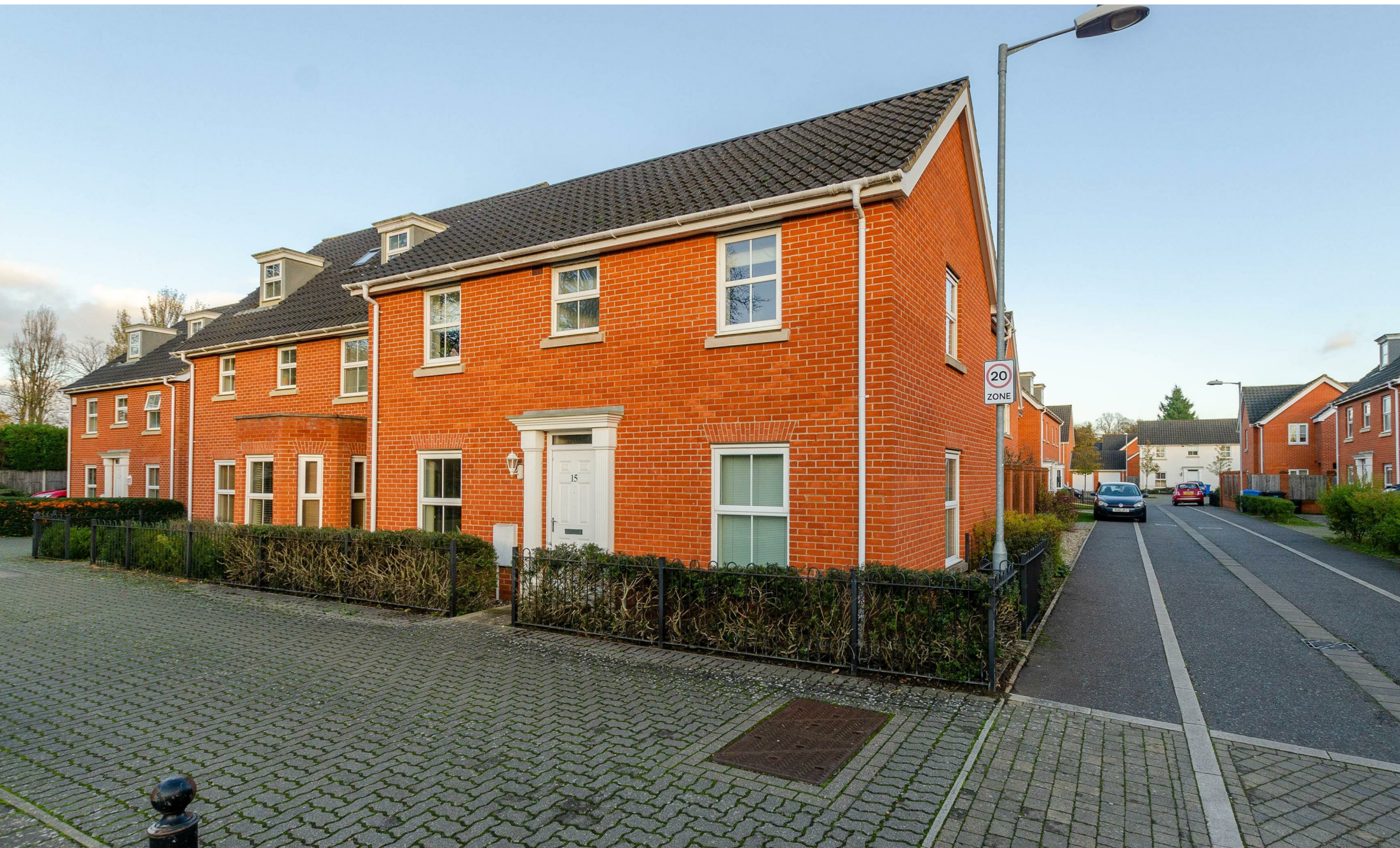
Earles Gardens | Norwich | NR4 PCM £2,850 PCM

Disclaimer – In accordance with the Property Misdescriptions Act, the company gives notice that all descriptions, references to condition, necessary permissions for use and other details are given in good faith and believed to be correct, but any intending lessees do not rely on them as statements of fact, but must satisfy themselves by inspection or other means, as to their accuracy.